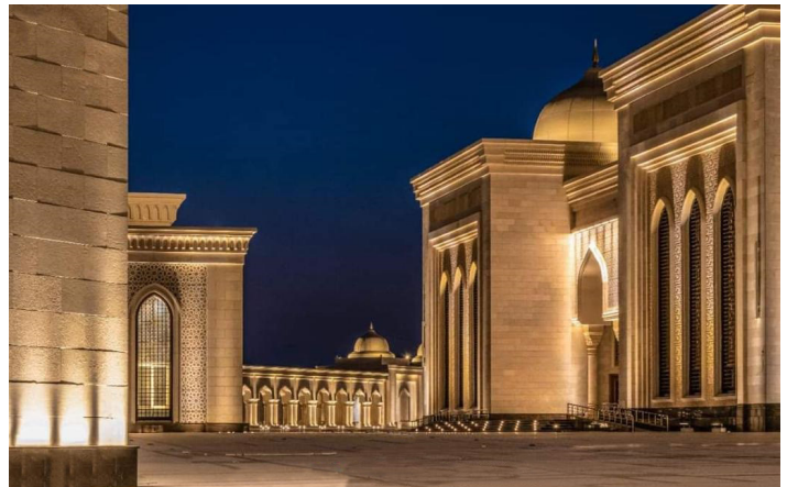
Islamic Cultural Centre, New Capital