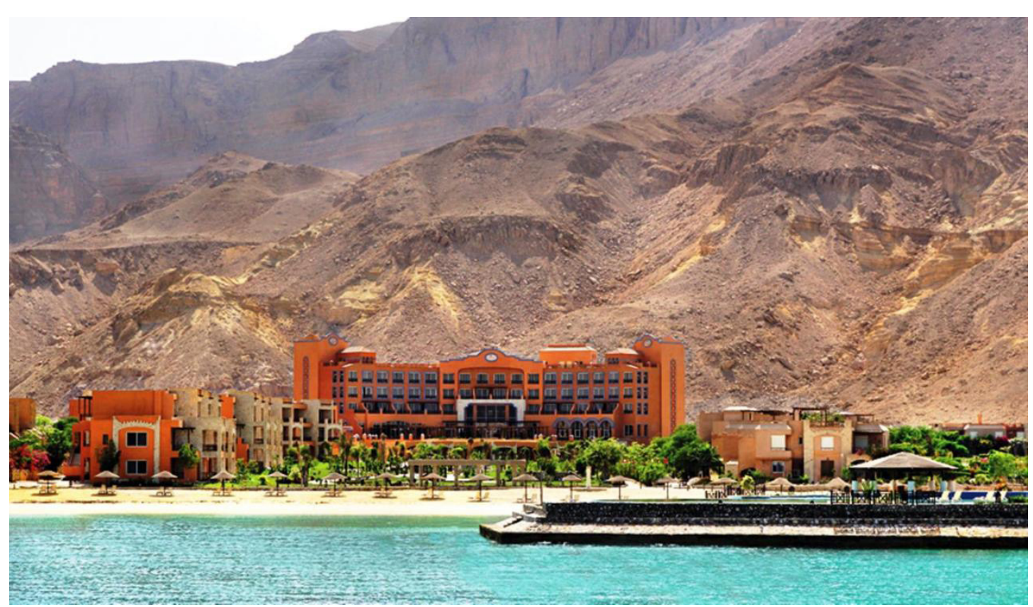
Renovation of Movenpick Al-Ain Al-Shokhna

The main building (42 rooms) consists of a basement, ground, and 3 floors; while the guest building (120 rooms) consists of ground and 2 floors.