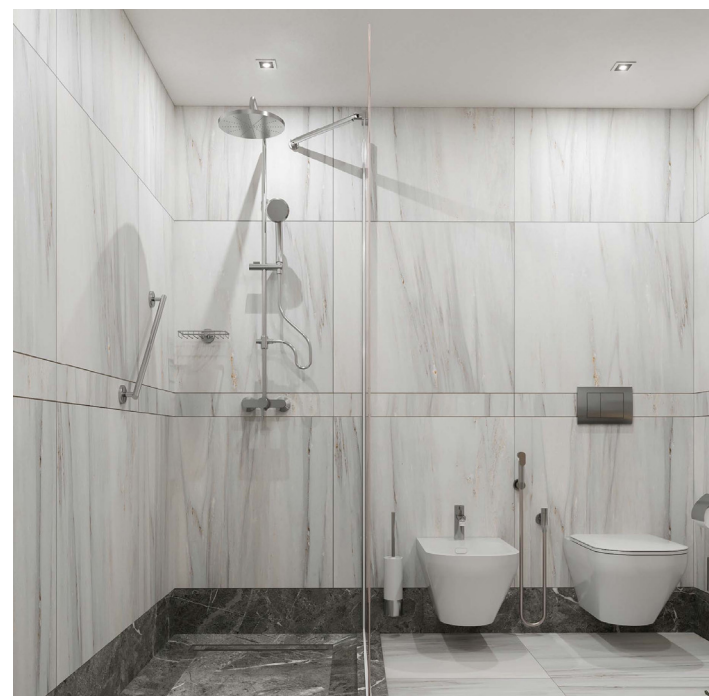
Renovation of Movenpick Al-Ain Al-Shokhna