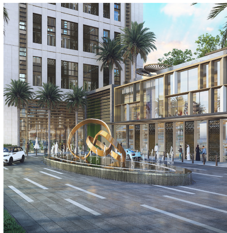
Madinah Hub Project