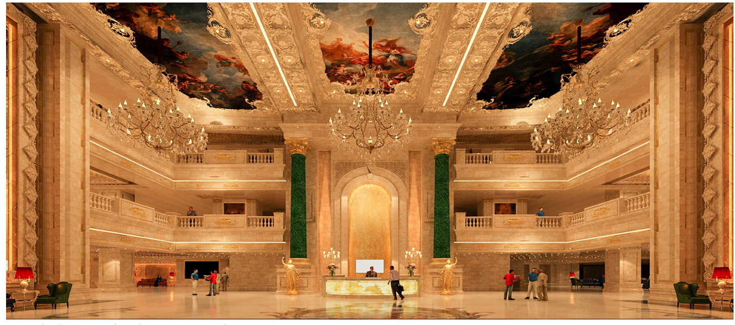
Arts and Culture City in the Administrative Capital